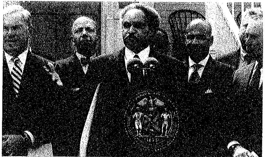
April 25, 2006: Big city mayors — including John Street of Philadelphia (at podium), joined by, from left, Boston's Thomas Menino, the District of Columbia's Anthony Williams, Douglas Palmer of Trenton, N.J., and New York's Michael Bloomberg — demand state and federal governments clamp down on interstate gun trafficking.

In the Midwest, Chicago police have traced guns used in crimes to dealers in neighboring Indiana. But the most notorious route for gun traffic flows from southeastern states such as South